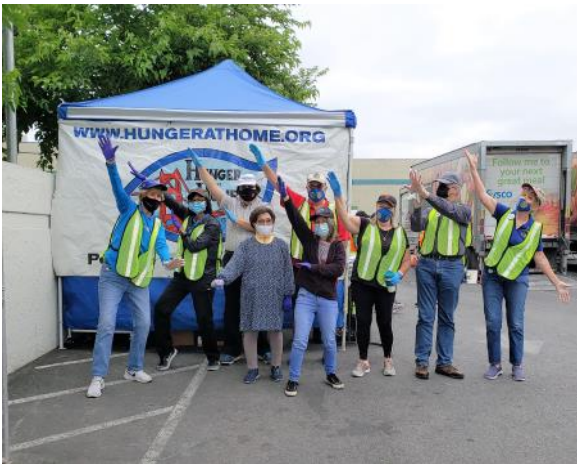
Rotarians & friends in front of Hunger at Home banner